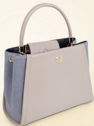
Alix lady bag nude CTX334X