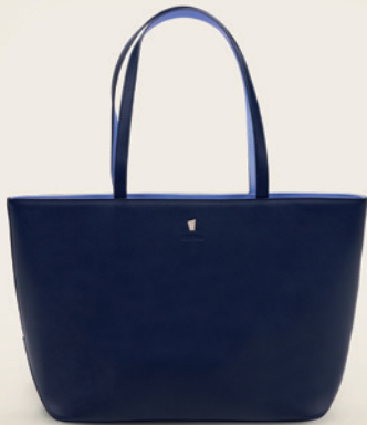
Mademoiselle lady bag navy FTX322N