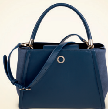
Alix lady bag navy CTX334N