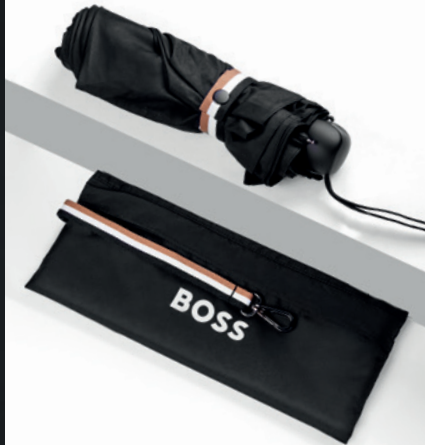
Iconic umbrella mini black HUG321A