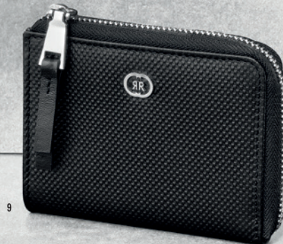
9. Regent card holder black - NLE329A