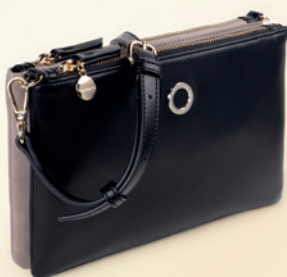
Alix lady bag black CTW334A