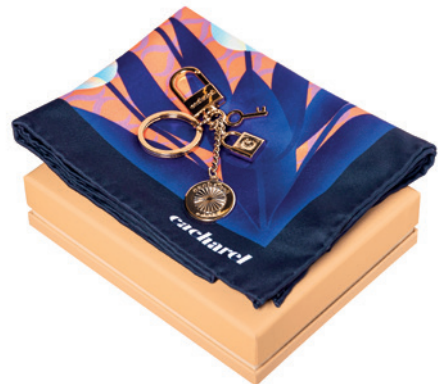
Set Alix key ring & Alix scarf - CPKM334N

The Alix handbags are classical accessories with a retro feel. They are finished with a new round Cacharel signature plate : elegant, understated and timeless, they play with contrasted smooth & suede materials and are accented with luxurious golden tones. Available in 3 color versions.