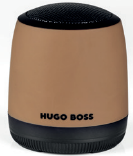
Gear speaker camel HAE007X