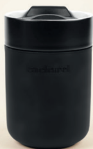
Alix isothermal flask black CAI334A