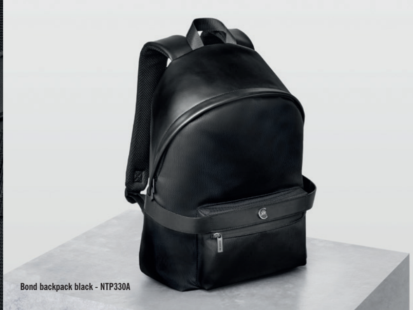
Bond backpack black - NTP330A