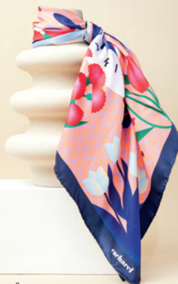
Alix scarf navy CFM334N