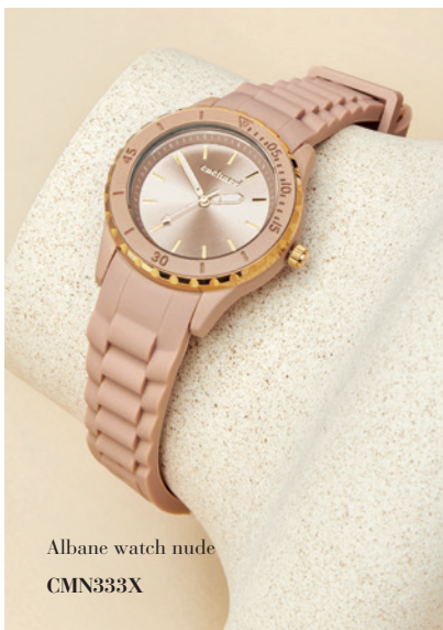
Albane watch nude CMN333X