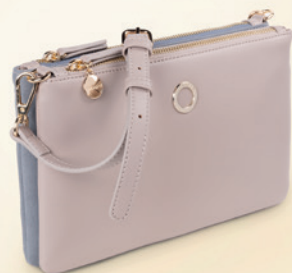
Alix lady bag nude CTW334X