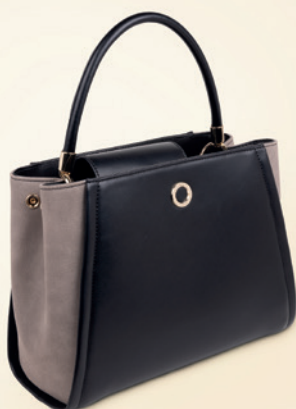
Alix lady bag black CTX334A