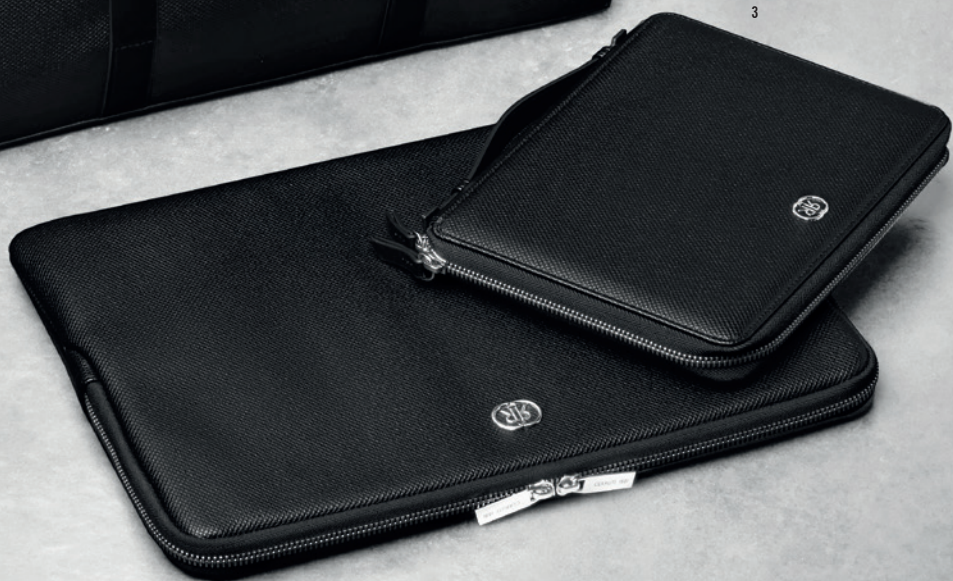
1. Regent laptop sleeve black - NTE329A