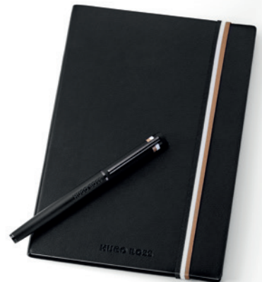
Set Iconic notebook A5 & Loop rollerball pen HPHR352A