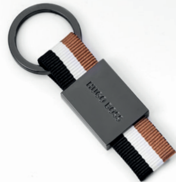
Iconic key ring style HAK385D