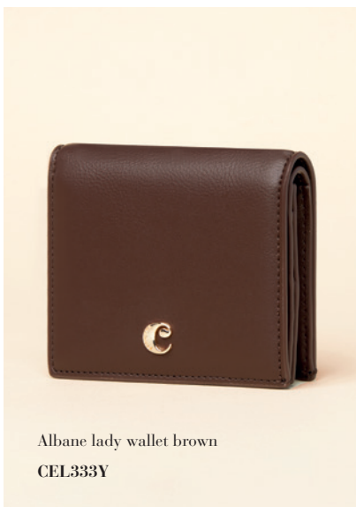
Albane lady wallet brown CEL333Y