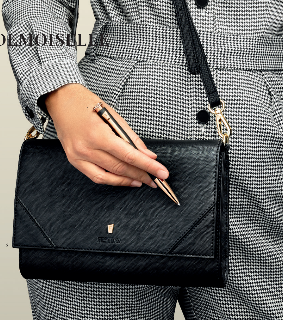
1. Mademoiselle ballpoint pen black - FSC2224A