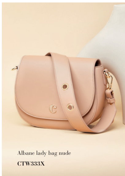
Albane lady bag nude CTW333X