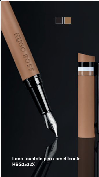
Loop fountain pen camel iconic HSG3522X