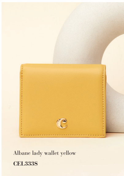
Albane lady wallet yellow CEL333S