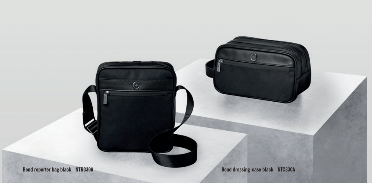
Bond reporter bag black - NTR330A