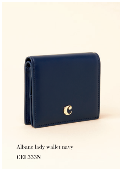
Albane lady wallet navy CEL333N