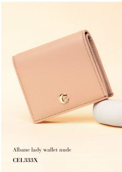
Albane lady wallet nude CEL333X