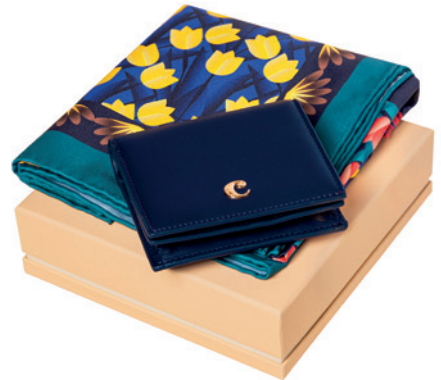
Set Albane lady wallet & Albane scarf - CPLL333N

The Albane handbags & wallets are the perfect everyday accessories. Their soft textures & golden signature have a resolute luxury feel. Available in 4 vibrant tones: Navy, Yellow, Brown or Nude, these items are perfect to mix & match with the eponymous scarves and watch to create colorful gift sets.