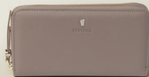
Mademoiselle travel wallet beige FEL222X