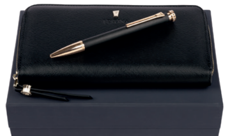
Set Mademoiselle travel wallet & Mademoiselle ballpoint pen - FPBL222A

Tote & crossbody bags for ladies are added this year to the already iconic “Mademoiselle” Festina collection. Made of beautiful, saffiano textured, vegan leather all products feature a golden F signature plate, and contrasted interiors as a guiding thread throughout the line.