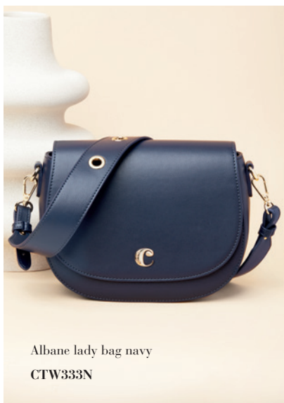
Albane lady bag navy CTW333N