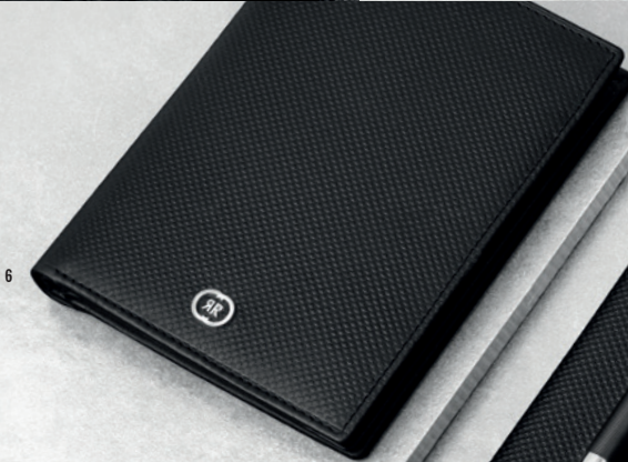
6. Regent travel wallet black - NLT329A