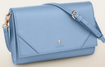
Mademoiselle lady bag light blue FTW322M