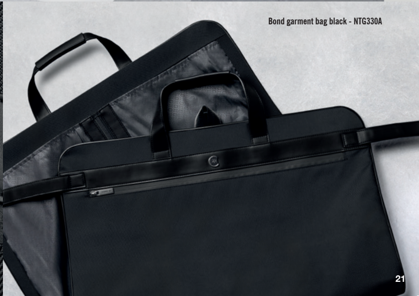
Bond garment bag black - NTG330A