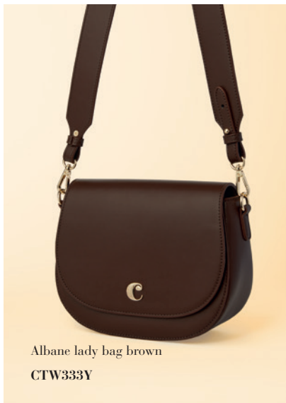
Albane lady bag brown CTW333Y