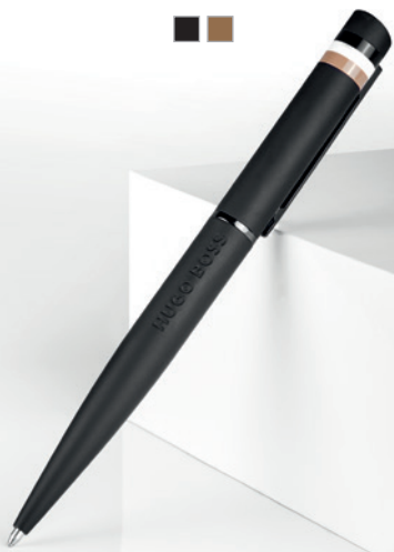
Loop ballpoint pen black iconic HSG3524A