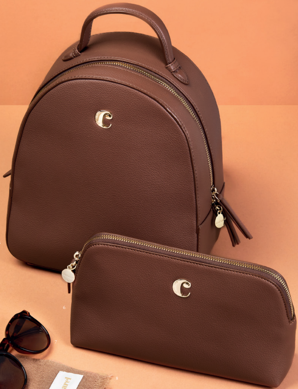
1. Alesia lady bag brown - cacharel - CTX218Y