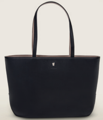
Mademoiselle lady bag black FTX322A