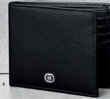
4. Regent wallet black - NLW329A