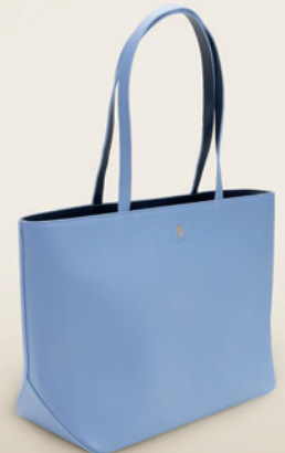
Mademoiselle lady bag light blue FTX322M