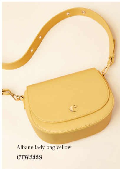
Albane lady bag yellow CTW333S