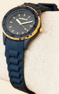
Albane watch navy CMN333N