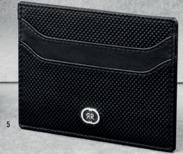
5. Regent card holder black - NLC329A