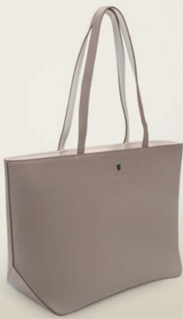
Mademoiselle lady bag beige FTX322X