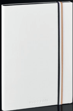
Iconic notebook A5 white HNH321WP