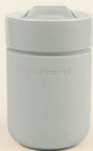
Alix isothermal flask grey CAI334K