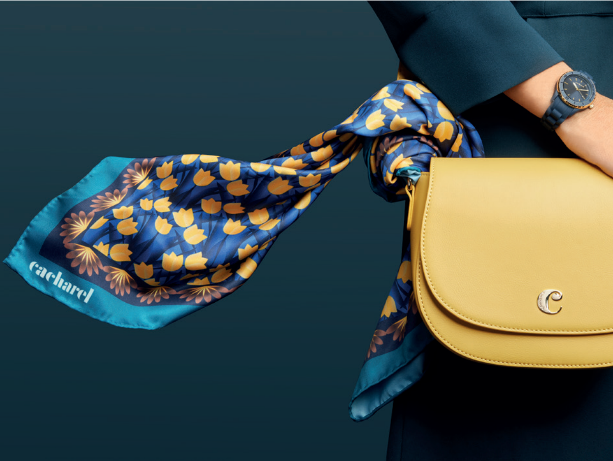
Albane scarf green - CFL333T