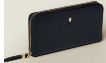
Mademoiselle travel wallet black FEL222A