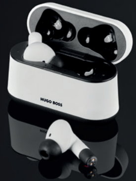
Gear Matrix earphones white-s HAP107W-S