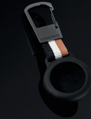
Iconic key ring with airtag holder HAA363D