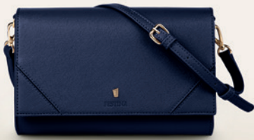
Mademoiselle lady bag navy FTW322N